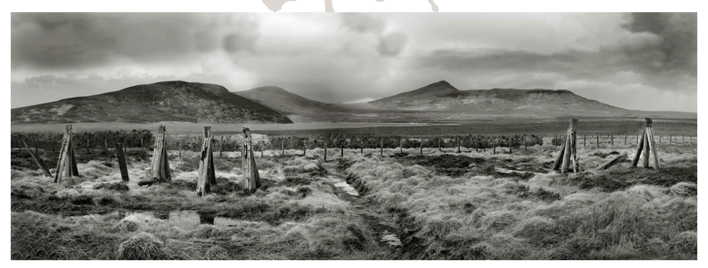
<u>Enjoy this gorgeous image from our very own</u> <u>Kelli Abdoney, photo teacher</u>